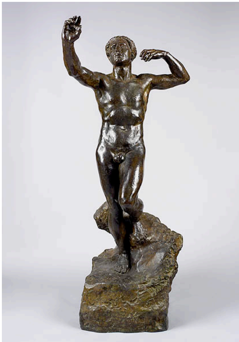
Charles Malfray (1887-1940), The Song of the Poet or Orpheus' Grief , 1914, bronze proof, # 1/8, Sand cast by Alexis Rudier, Signed: CH. MALFRAY 1914; H. 117, W. 40, D. 40 cm.