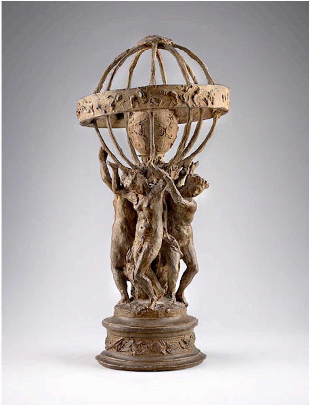
Jean-Baptiste Carpeaux (1827-1875), Model for the Four Parts of the World , 1867, Terra cotta proof, Signed : J. B. Carpeaux, H. 55 cm.